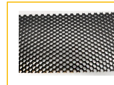
Cellular network Aluminium alloy