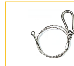
Safety wire SUS304