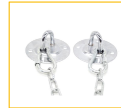
Stainless Steel Chain SUS304