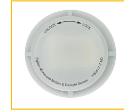
Zigbee controller with Microwave motion sensor & daylight sensor 6-12Vdc input