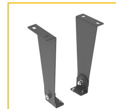
±90° rotatable bracket SPCC material