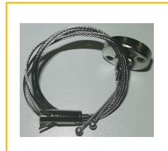
Steel Wire Rope SUS304 material