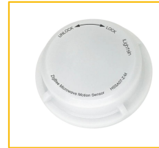
Zigbee controller with Microwave motion sensor 6-12Vdc input.