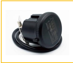
Microwave motion sensor 120-277Vac input, IP65,max detect height is 15m.