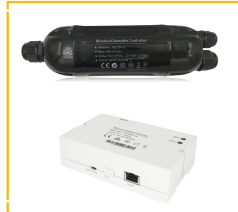
Zigbee wireless controller 1pcs for each luminaire