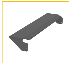
Shading cover Aluminium alloy